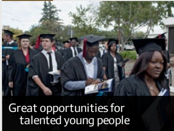
Great opportunities for talented young people