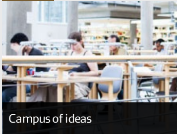
Campus of Ideas