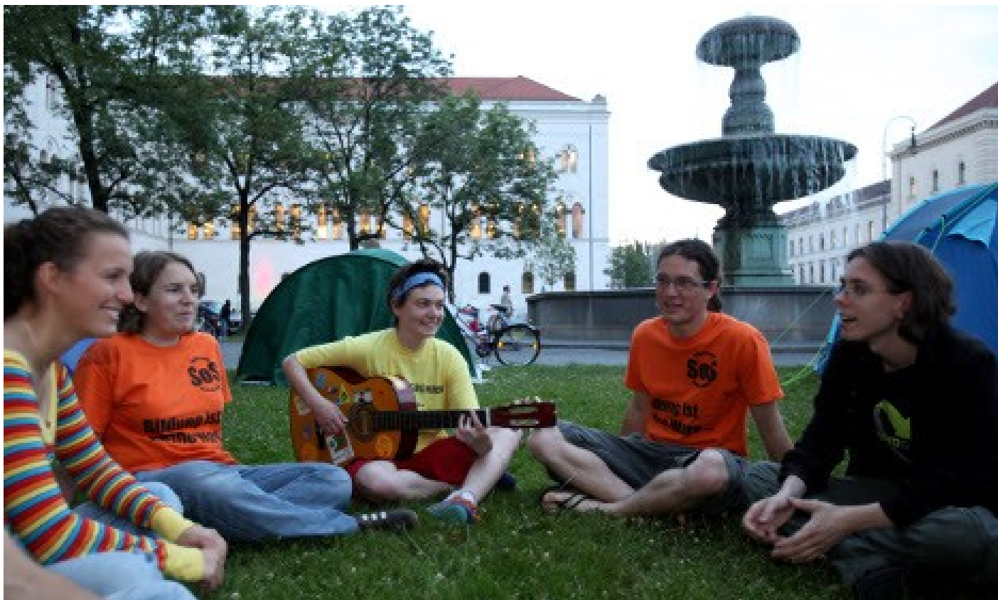
Students at LMU Munich, ranked the top university in Germany.